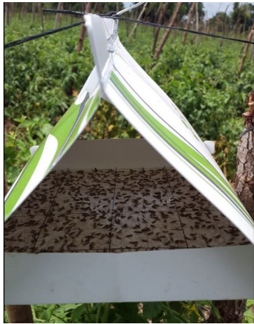
Delta Pheromone Traps with a sticky liner: T. absoluta monitoring.