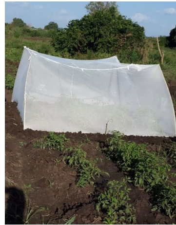
Netting materials used.