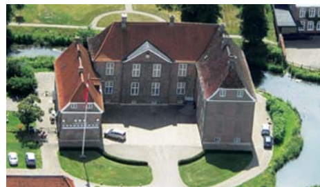
Gram Slot main building

In order to actualize this vision the owners of Gram Slot have engaged in a number of activities reaching beyond a mere agricultural production. These activities constitute the leisure branch of the castle, which generates approximately one third of the overall turnover. Related to the vision of re-creating the castle as a local power center is the ideal of organic farming. Gram Slot is the largest organic dairy farm in Denmark with 1300 hectares together with 350 dairy cows, and thereby serves as an example that organic farming can be done successfully on a large scale in Denmark.