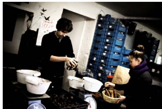
Food Community members prepare vegetables for distribution at one of the Danish Food Communities in Copenhagen.

The Food Communities was chosen as a case for HealthyGrowth because they constitute a major novelty within the Danish foodscape. The Food Communities have emerged as the latest incarnation of a series of attempts to forge alternative food networks operating beyond the supermarket system. Denmark is distinguished by a large market share of organic food being sold via supermarkets, but The Food Communities are a novelty due to two factors, (1) they have experienced a rapid growth since the outset in 2010, and (2) they are organised in decentralised manner, where they continue to split up the network in chapters, each operating within their distinct local area. This can be described as a matter of 'upscaling by multiplication'. The Food Communities are a predominantly urban phenomenon, as the farmers are not formal members of the organization.