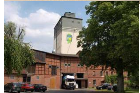
Bohlsener Mühle: main office building and mill facilities ( www.bohlsener-muehle.de )