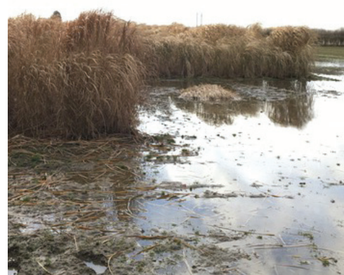
Flooded field in Lincolnshire, March 2018