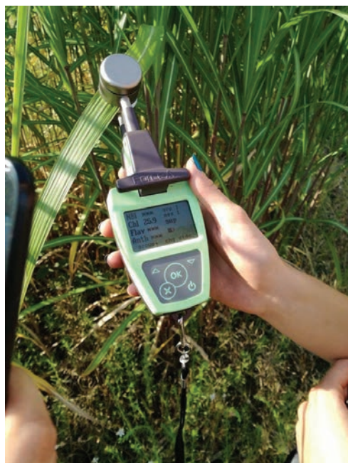
Bytom site - plant pigments content measurements, July 2017

Work carried out at the Polish test site focused on the assessment of plant growth and biomass productivity in the second growing season. Two new hybrids, which replaced those which had not survived the