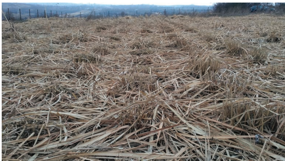
Bytom site - waiting for the next growing season, March 2018