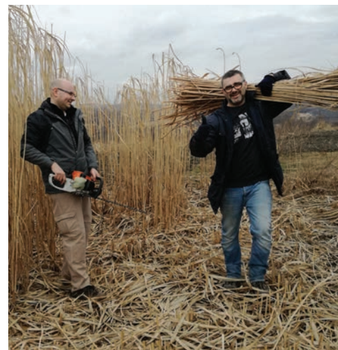
Bytom site - winter harvest, March 2018

The main finding of the performed analyses was that seed-based hybrids after the second growing season showed biomass production comparable to that of M. x giganteus . It was also confirmed that seed-based hybrids were characterised by lower heavy metal uptake to aboveground parts than commercial M. x giganteus , showing phytostabilisation abilities and giving the opportunity for safe biomass production on contaminated soil. As the next step, the collected biomass will be analysed by the Hohenheim University for energy production through combustion and anaerobic digestion.