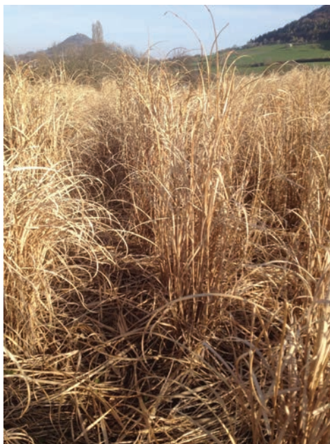
Miscanthus sinensis at Unterer Lindenhof

The analysis of chloride content showed that the average chloride content from all locations and all genotypes was 0.04 % of DM. The genotypes at Katowice had the lowest chloride contents, the genotypes at Aberystwyth had the highest with UHOH found between the two. At each location Mxg had the lowest or was near to the genotype with the lowest chloride content.