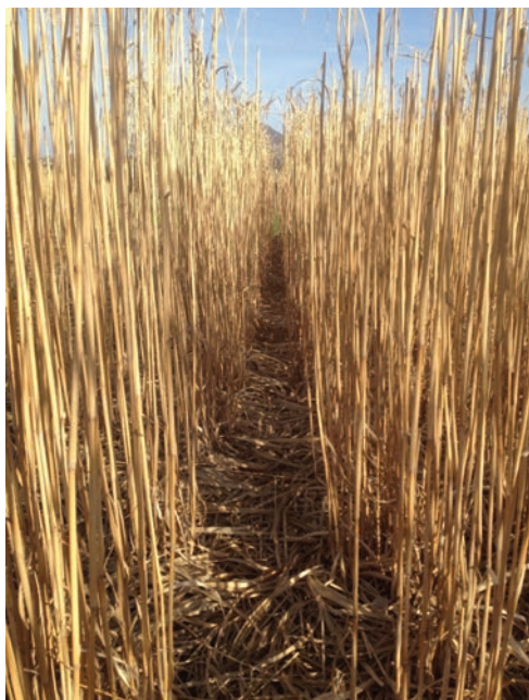
Miscanthus x giganteus at Unterer Lindenhof