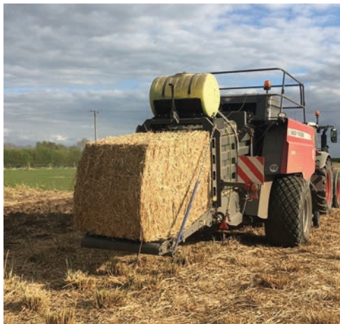
Lincolnshire site - Harvesting the biomass, Spring 2017