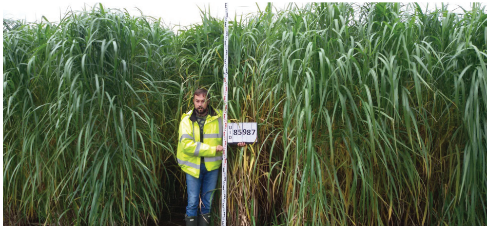
Lincolnshire site - phenotyping, Autumn 2017