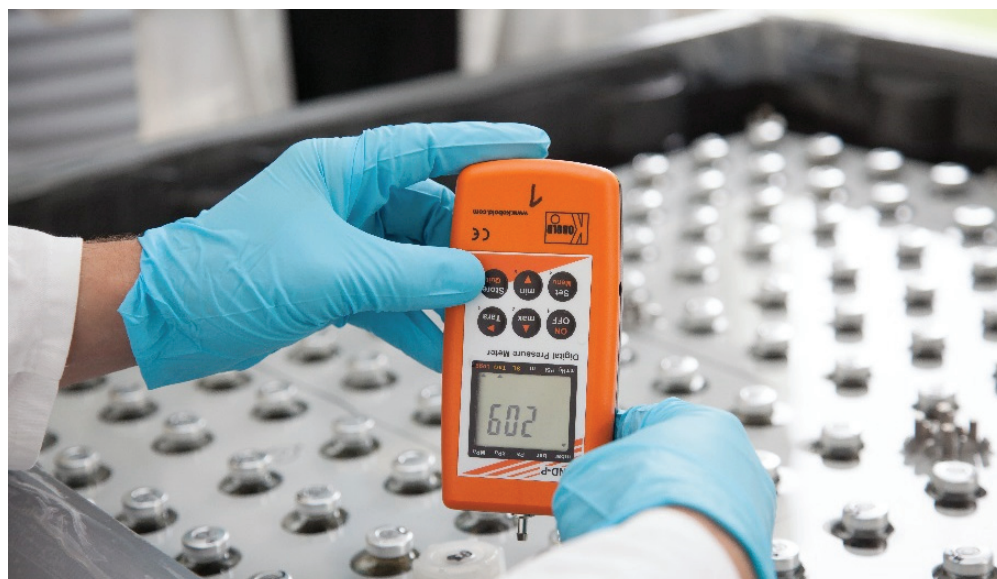
University of Hohenheim - biogas batch test

The assessment of the ash melting behaviour showed that the biomass from UHOH location had on average the highest and from IETU location the lowest ash fusion classes at each temperature. The results showed that the increased heavy metal concentrations in the biomass had no negative effects on the ash melting behaviour. At the UHOH site, the novel genotypes tended to have lower ash fusion classes than the standard genotype Mxg and therefore an improved combustion quality. In Katowice (IETU), GNT41 is the most suitable and GNT14 the worst suitable genotype for combustion concerning the ash melting behaviour. In Aberystwyth (IBERS), GNT3 had poorest results in ash fusion classes, Mxg was the most suitable genotype for combustion.