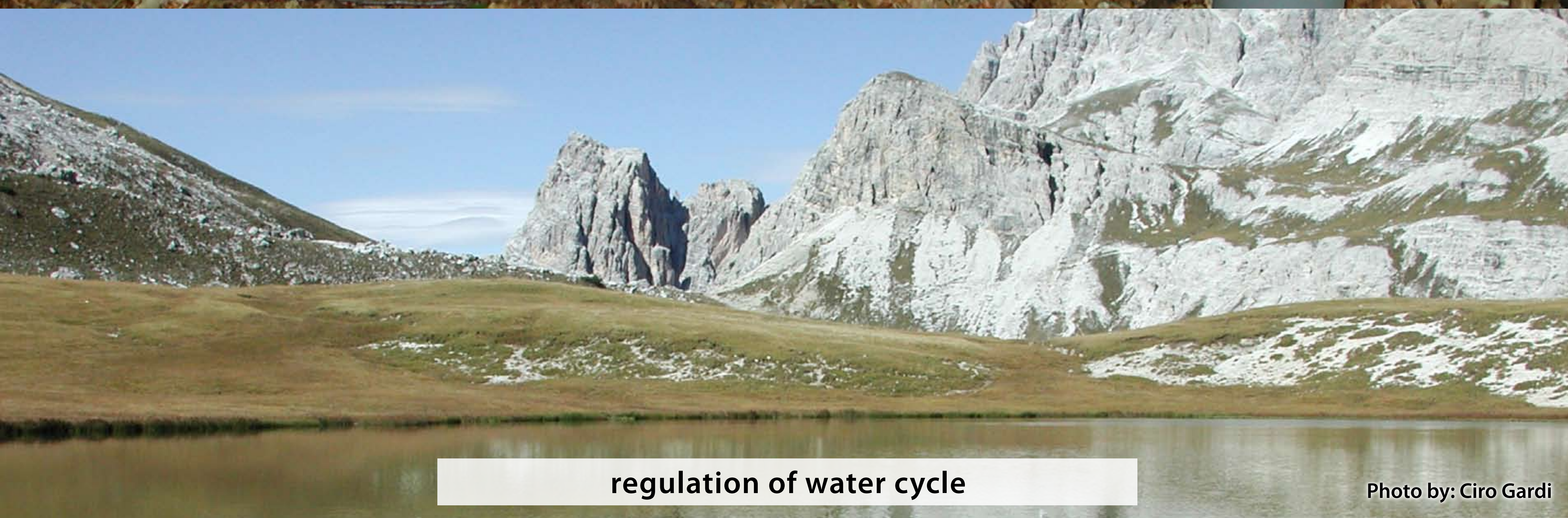
regulation of water cycle