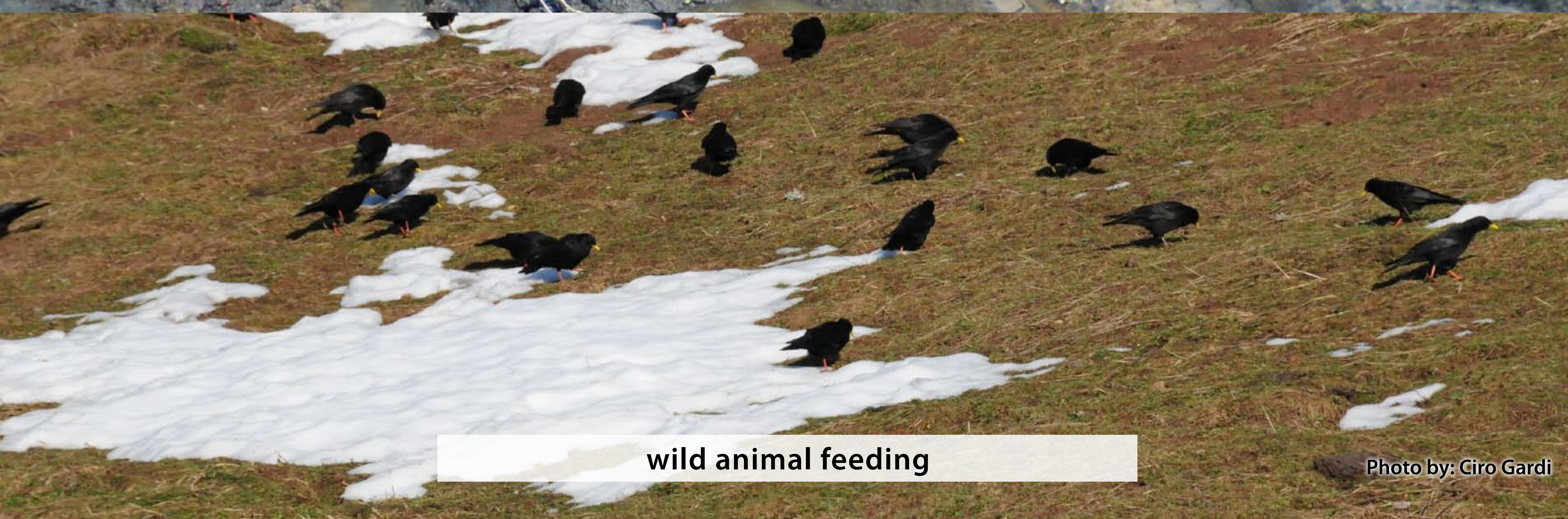
wild animal feeding