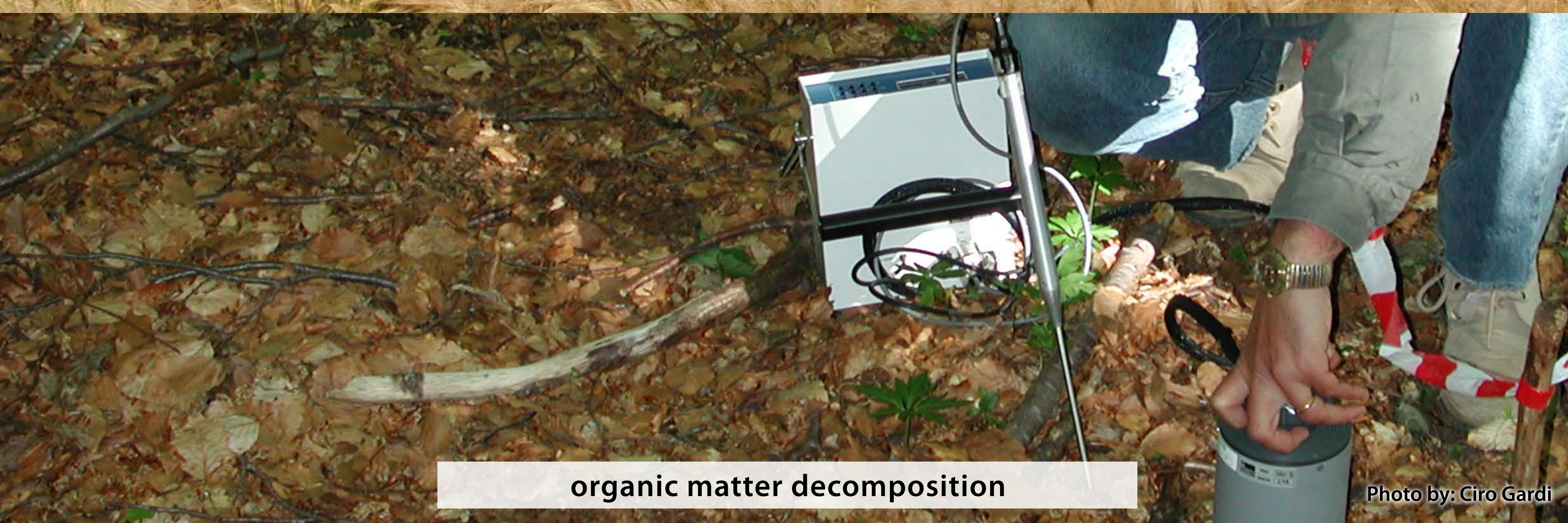
organic matter decomposition