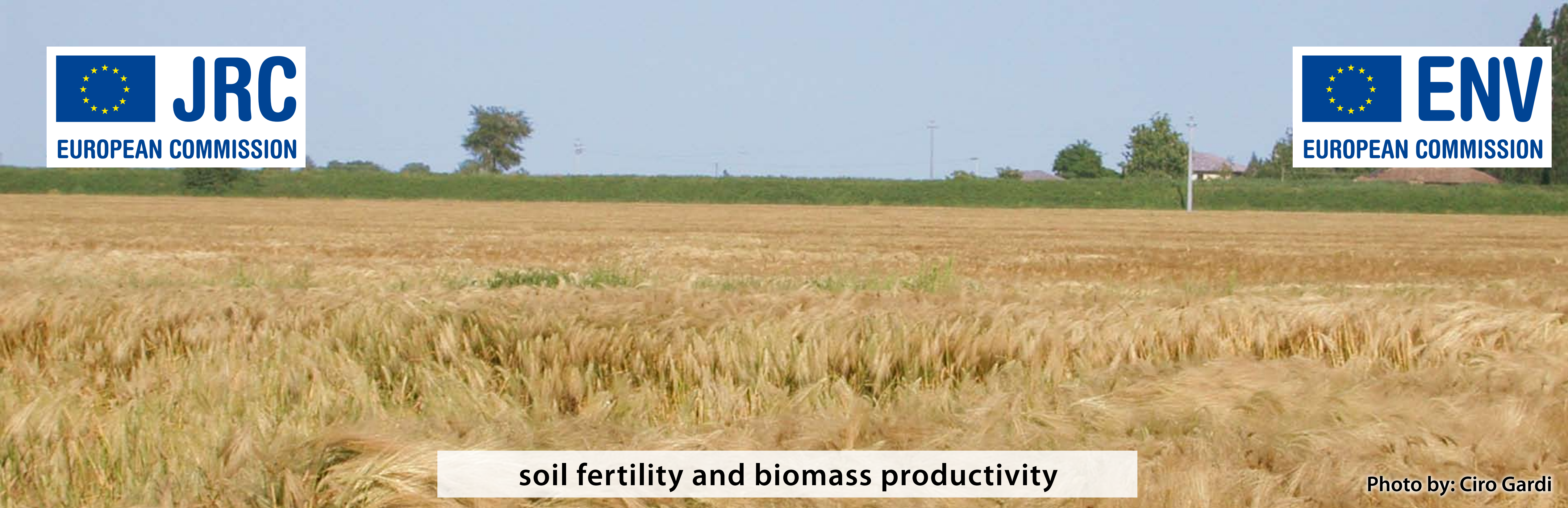
soil fertility and biomass productivity