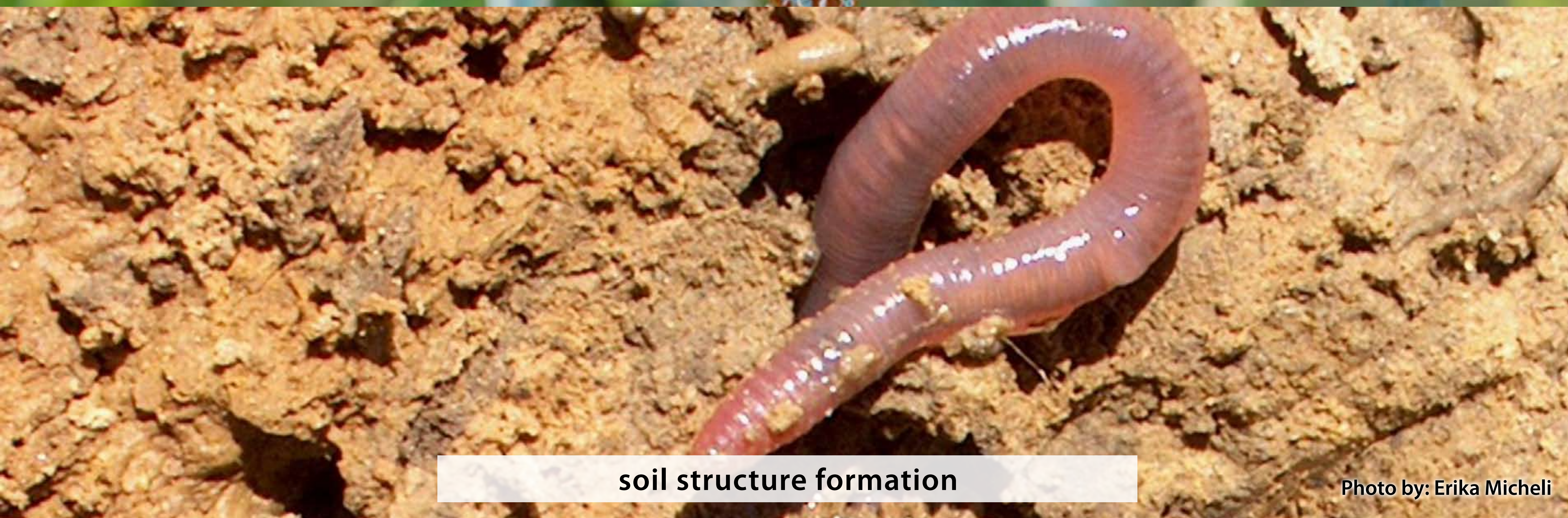
soil structure formation