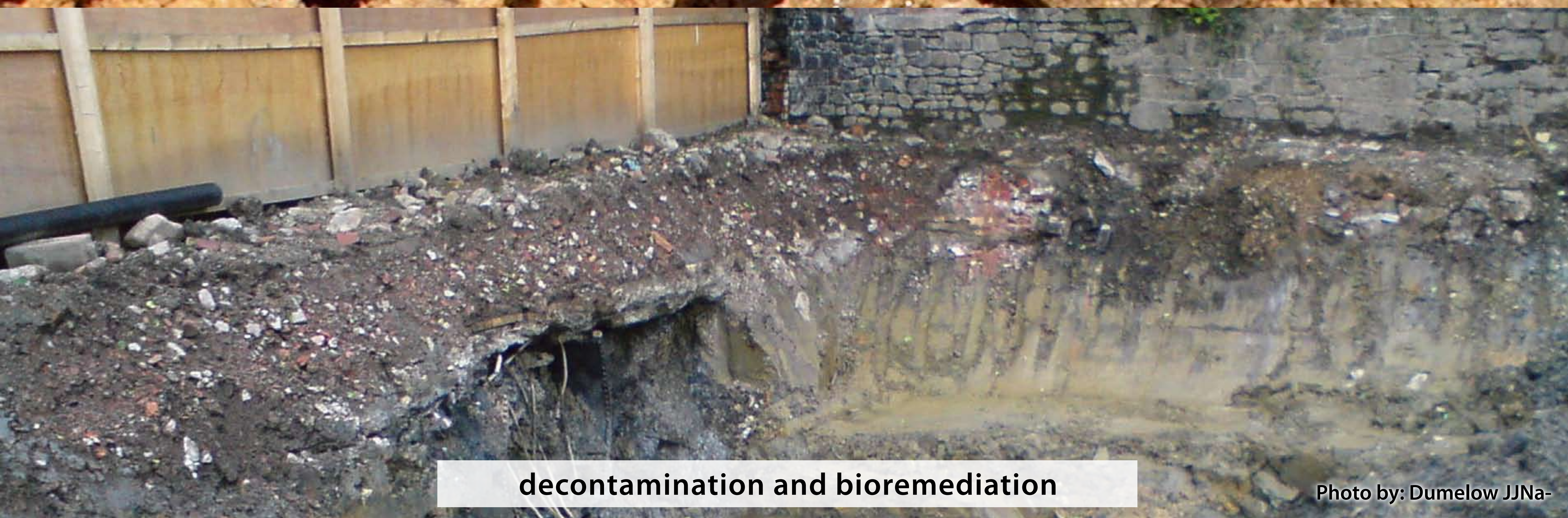
decontamination and bioremediation