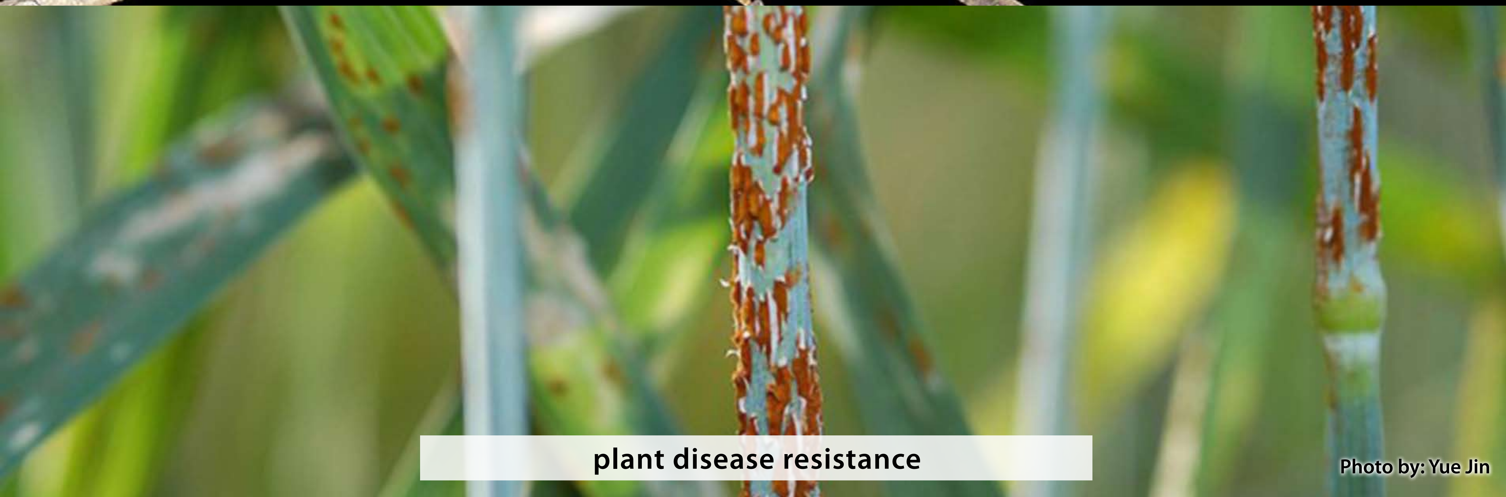
plant disease resistance