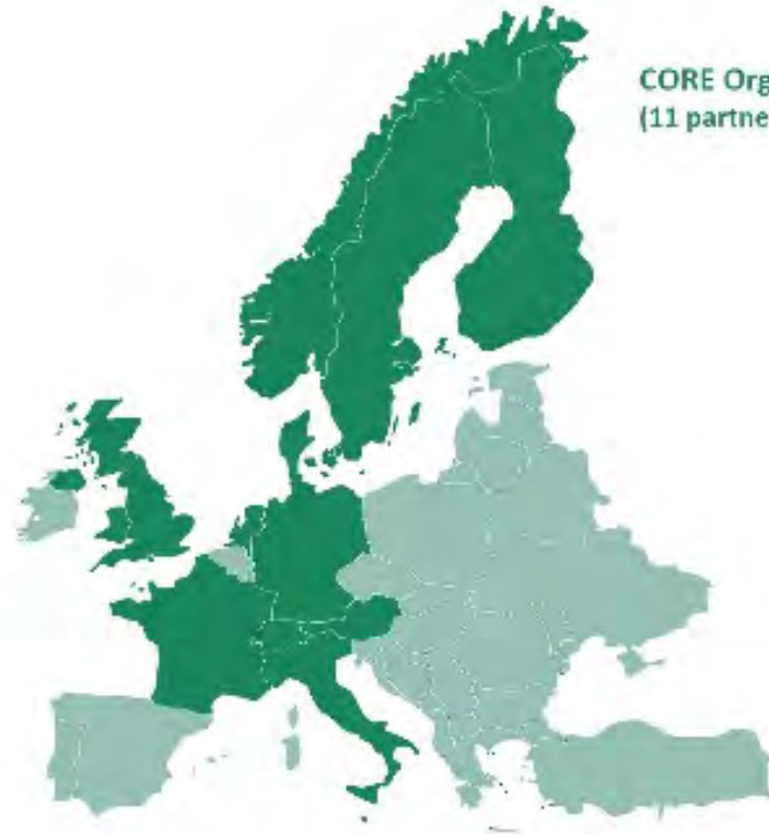
CORE Organic I - 2007 (11 partner countries)