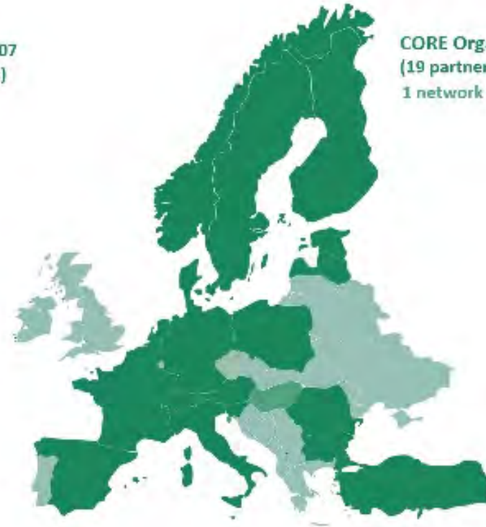
CORE Organic Cofund - 2016 (19 partner countries/regions 1 network member)

Coordination of European Transnational Research in Organic Food and Farming Systems - 15 Year Anniversary in 2019.