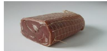
Lamb roll from Røros Meat

Røros Meat is located in Røros, which is a small town in the mountain region of the eastern part of Southern Norway. Røros was historically a mining town and is on the UNESCO's World Heritage List. Røros Meat, established in 2003, is a private limited company. The local meat processing company emphasize local and traditional products. Since 2011, the company has produced organic hamburgers for the retail chain Rema 1000. Røros Meat has developed organic products