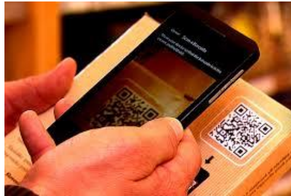
Using a smart phone to scan the QR code on the packaging to get information about producers.

The “Ekodar” organic beef label was established in 2009 by the Šaleška Valley agricultural cooperative. Currently, 76 producers/farmers label their products with the Ekodar brand, which speaks to a connection of trust between producers and consumers. The meat is available in eleven large retailers, such as Mercator, two organic shops, two agricultural co’ops, as well as online, and delivery is available in twelve cities throughout Slovenia. Marketing and distribution is done via the central umbrella of the Šaleška Valley (owner of the brand) agricultural cooperative. The special characteristic