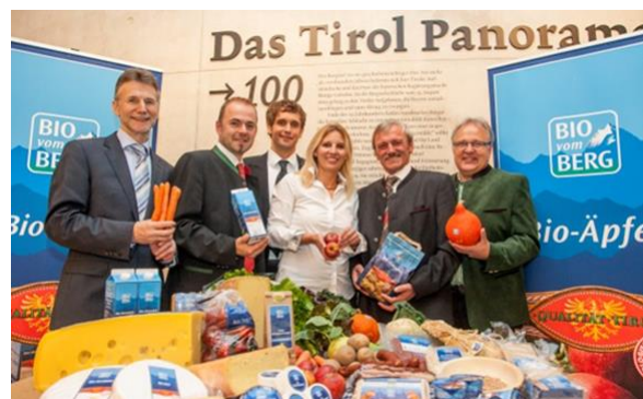
Representatives of Agrarmarketing Tyrol (AMT), Chamber of Agriculture, MPreis, the federal government and Bio vom Berg at the cooperatives' 10 th anniversary.

For instance, the product range has increased from initially 8 products (two meat products and six dairy products) to approximately 130 today and turnover has risen from 672,000 euros in 2003 to 6.3 million in 2014. As far as we know, Bio vom Berg is the only producer-owned brand in Europe which offers a full range of organic products in a supermarket chain. The main objective of BioAlpin is to sustain and facilitate organic and regional small-scale mountain farming by providing farmers with processing facilities and market access. In this respect the cooperative acts as a kind of mediator between farmers, processors and retailers. It coordinates production, negotiates prices and quantities with the retailer partners and organizes logistics. To simplify processes the cooperative organizes and coordinates individual farmers within producer groups. This helps to