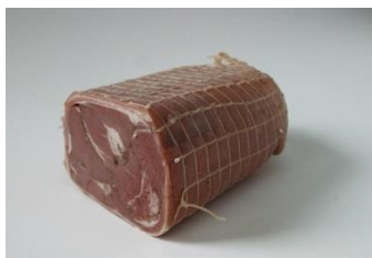
Figure 4: The lamb roll

Røros Meat receives all calves from Røros Abattoir, both conventional and organic (670), and lambs (2500) and organic cattle. They process a range of products, mainly traditional products for the region. The firm has managed to obtain approval for use of the Specialty brand for the lamb roll – cooked and raw (Figure 4). Additionally they use the organic label for organic products and the Røros brand and own brand for all products.