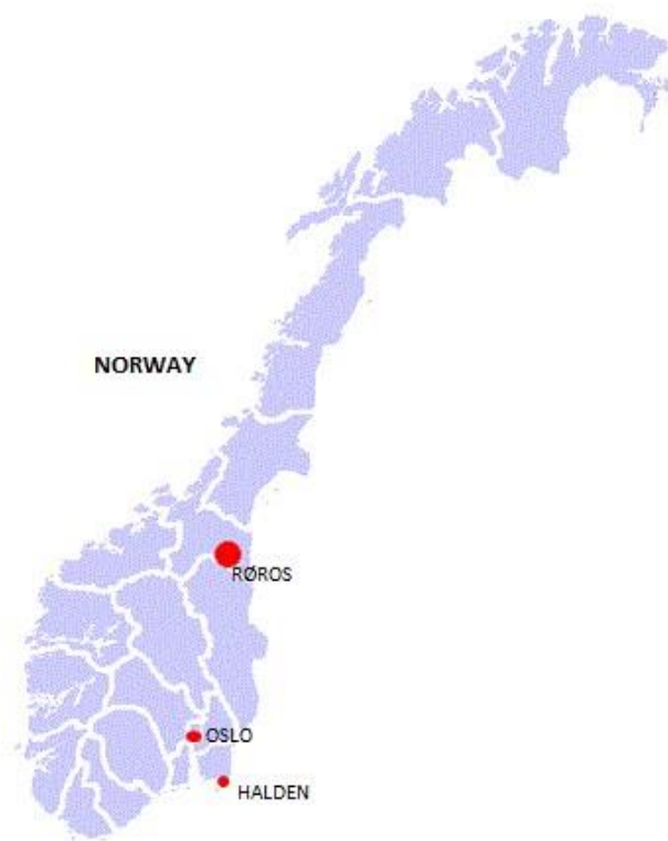
Figure 1: Map of Norway and Røros

Røros Dairy is the only organic dairy in Norway, established in 2001. It has experienced a steady growth since established and has today 20 employees and a turnover of 45.5 mill NOK (5,5 mill EUR) in 2013. There have been periods of economic struggles, but today the dairy is profitable and perceived as one of the most successful organic firms and value chains in Norway. Their success in combining growth with organic and other product qualities is the reason why we selected the dairy and its value chain as a case in the Healthy Growth project.